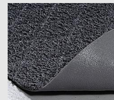
#125: with foam backing (1/2")